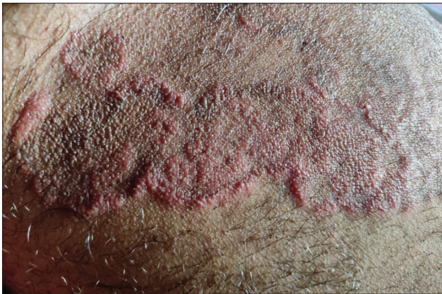
Figure 2: Tinea cruris before treatment (08 June 2022)