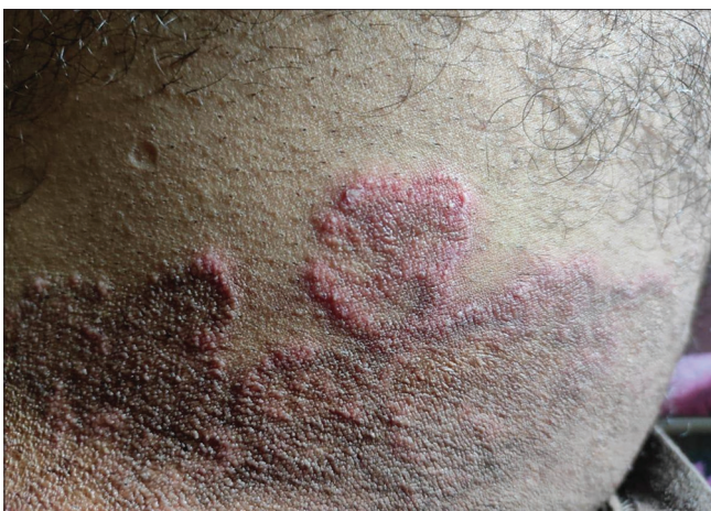
Figure 3: Tinea cruris during treatment (28 June 2022)