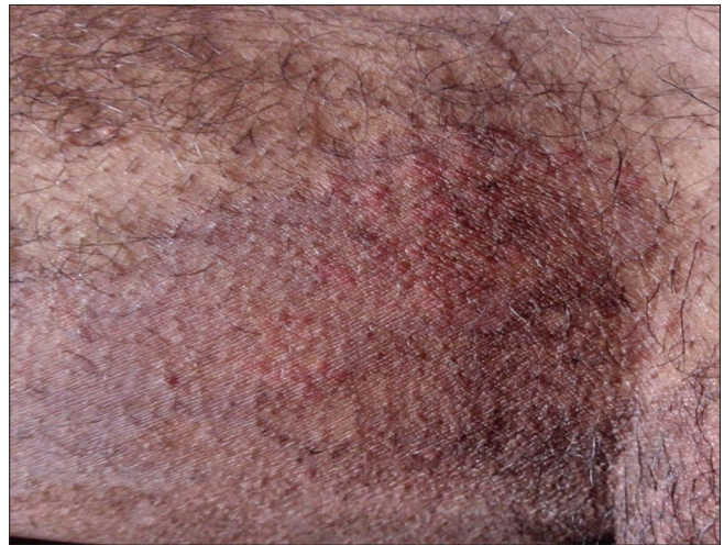
Figure 5: Tinea cruris during treatment (20 August 2022)