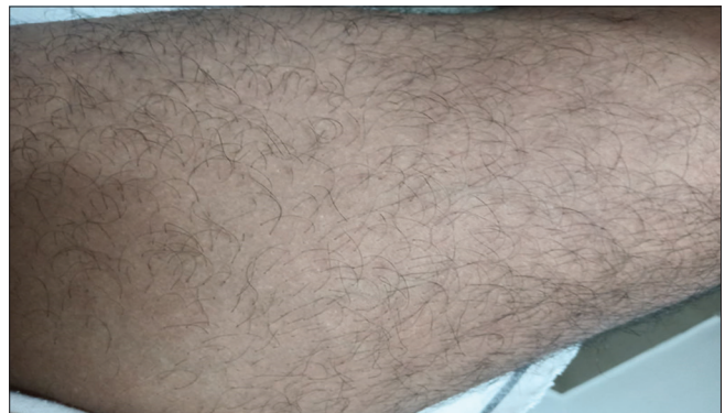
Figure 6: Tinea cruris after treatment (30 August 2022)