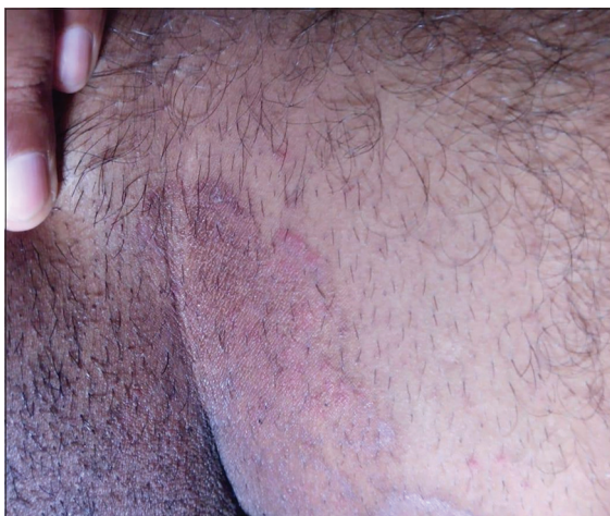
Figure 4: Tinea cruris during treatment (18 July 2022)

is clinical but can be confirmed by microscopic examination of potassium hydroxide wet-mount preparations of skin scrapings from the active border of the lesion. [5] In this case, we had suggested an investigation of KOH examination to diagnose tinea cruris, but the patient resided in a small town with limited investigation facilities, so the diagnosis was