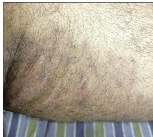
Figure 7: Lesions as on 6 April 2022 Inner thigh (Left)

treating tinea cases and their role should be explored further to validate their utility.