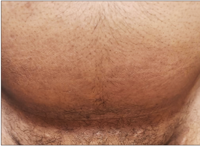
Figure 8: Lesions as on 8 June 2022 Lower Abdomen