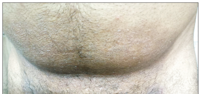
Figure 6: Lesions as on 6 April 2022 Lower Abdomen