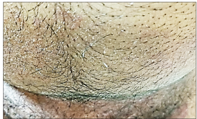
Figure 2: Lesions as on 12 January 2022: Lower abdomen

The previous studies also show the significant role of individualised homeopathic medicines in dermatophyte infections. However, the homeopathic literature has little evidence of treatment of fungal infection which is also mentioned in the case report by Gautam and Goel. [18] Interestingly, two cases of tinea faciei treated with homeopathic medicines have been reported, out of which one case was treated with Natrum muriaticum 30C and potency was increased as per need. [10] Further, a few traceable reported literature for tinea cruris were found. Another case of tinea cruris successfully treated with Sulphur highlighted the