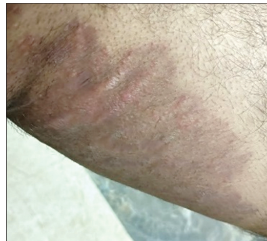
Figure 3: Lesions as on 12 January 2022: Inner thigh (Left)

importance of miasms for effective prescription. [19] The above literature suggests that homeopathic medicines are useful for