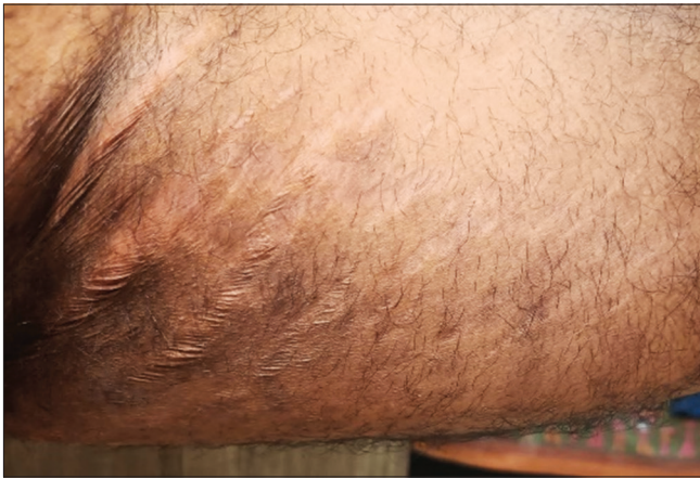
Figure 9: Lesions as on 8 June 2022 Inner thigh (Left)