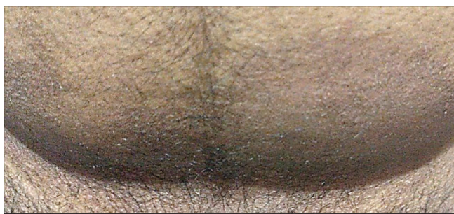
Figure 4: Lesions as on 23 March 2022: Lower abdomen