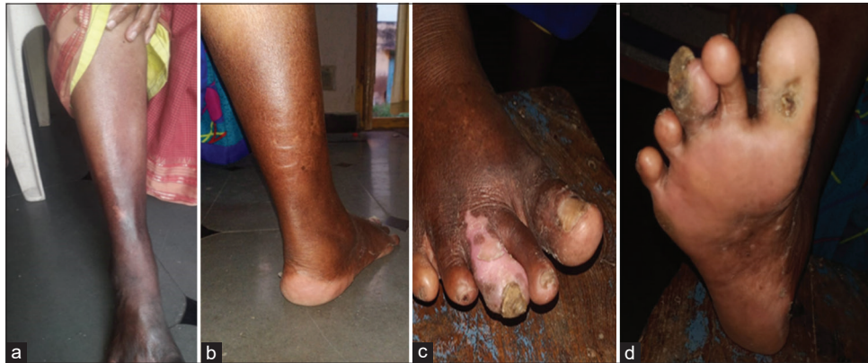
Figure 3: Photographs of gangrene case (a-d) during treatment: 19 August, 2021