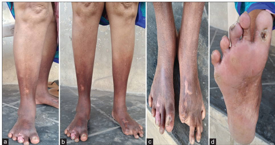
Figure 4: Photographs of gangrene case (a-d) after treatment: 27 October, 2021