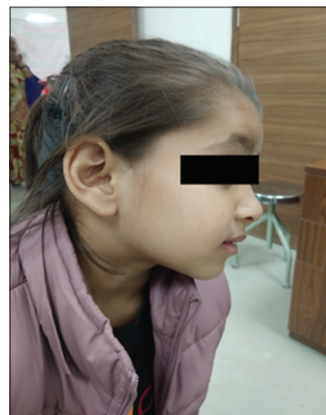
Figure 7: Warts disappeared from the forehead and cheek on 3 rd visit on 20 November 2019