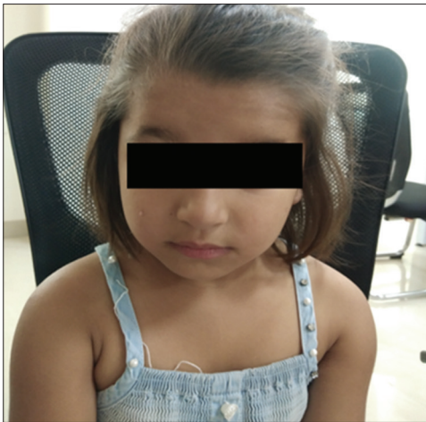
Figure 2: Number of warts – Right side of the forehead 5–6 small warts and 1 wart on the right side of the cheek on first visit on 24 October 2019