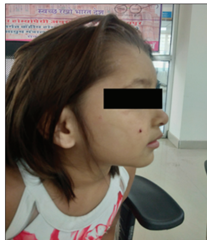
Figure 5: Inflammation of wart on the cheek with reduction in the number of warts on forehead on second visit on 5 November 2019