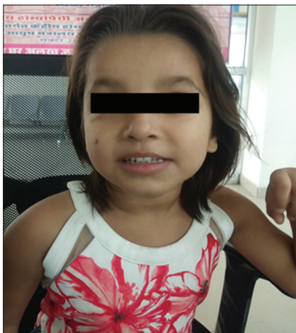
Figure 4: Inflammation of wart on the cheek with reduction in the number of warts on the forehead on second visit on 5 November 2019