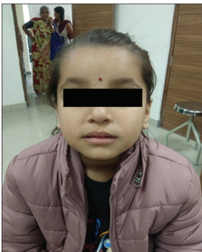
Figure 6: Warts disappeared from the forehead and cheek on 3 rd visit on 20 November 2019