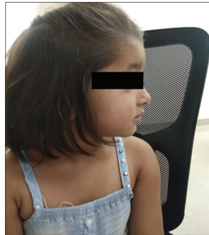
Figure 3: Number of warts – Right side of the forehead 5–6 small warts and 1 wart on the right side of the cheek on first visit on 24 October 2019. Side view