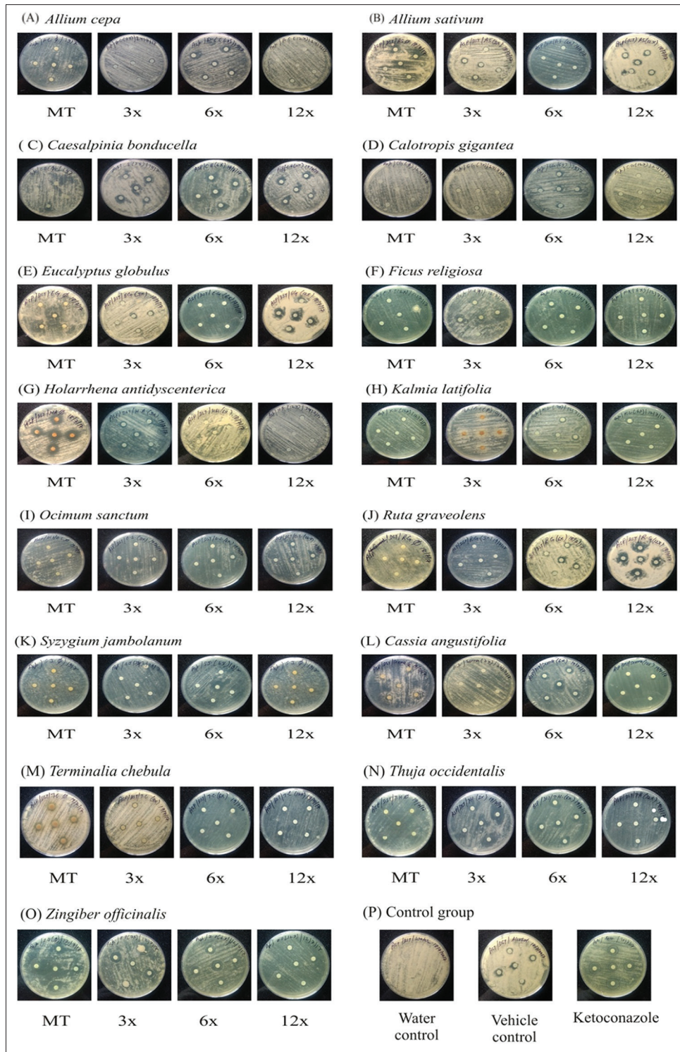
Figure 2: Effect of homoeopathic medicines against fungal strain Aspergillus niger

with 6x (35%) and Z. officinale with 3x and 6x (62.50% and 42.50%, respectively).