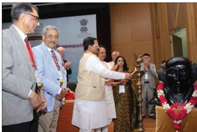
Figure 1: Hon'ble Minister of AYUSH lighting lamp on the occasion of World Homoeopathy Day

advancement of Homoeopathy. He requested the Honourable AYUSH Minister to expedite the process of development of research centres so that the Council continues to progress in the arena of homoeopathic research and bring about the much-needed research outcomes. He also informed that the Government will assure to extend its full support to propagate homoeopathic system of medicine.