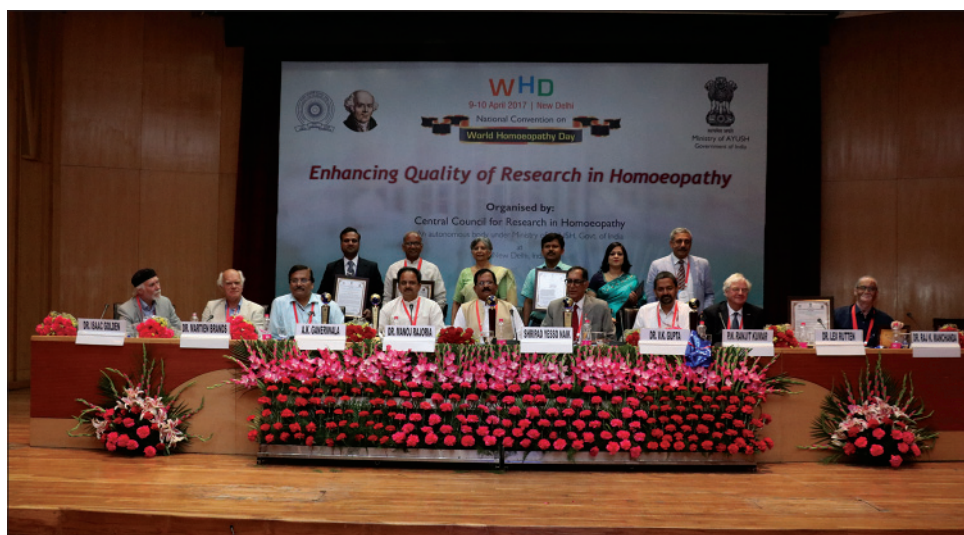
Figure 5: Awardees with the dignitaries on the dias