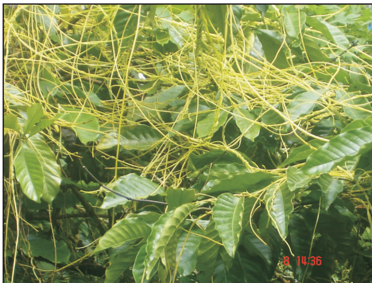
Fig. 1: Twining stem of Cuscuta reflexa on host plant

Microscopy: In surface, epidermis consists of polygonal linear cells; sides straight to curved with a few starch grains. Surface is striated; stomata a few, anomocytic and cyclocytic. Transection of the stem is rounded and slightly wavy in outline. Epidermis is one layered, covered by slightly thick cuticle; cells tabular, oval to oblong, few barrel shaped; walls thickened; contents dense with tannins and starch grains in a few cells. Cortex is 7-10 layered, cells polygonal to spherical, 15-38 \mu\text{m} (average 28) in diameter, walls