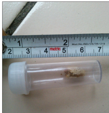
Figure 3: Expelled urethral calculus