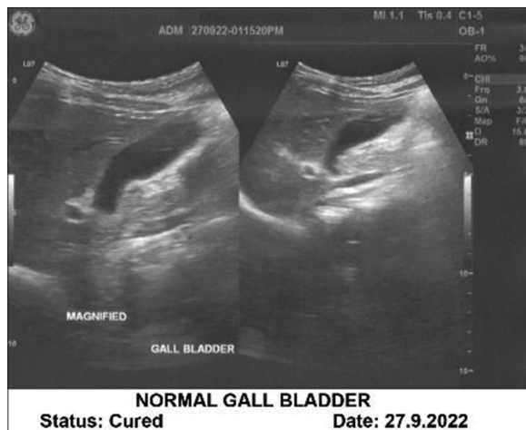
Figure 3: Ultrasonography findings post-treatment

medicine Phosphorus 30C was selected based on the totality of symptoms considering the constitution of the patient, mental and physical general symptoms. Besides the chief complaints, nail-biting, fear of being alone, starting during sleep and tendency to catch cold, also subsided. Spontaneous resolution of stones may occur in children but not in every patient. In this case, the stone was dissolved in a plausible timeframe by homoeopathic treatment. The treatment was complemented by Chelidonium Q . Since Phosphorus was selected based on the constitution, mental and physical general symptoms and prescribed in dynamic form (30c potency) thus Chelidonium was prescribed in material dose as a mother tincture. No adverse effects were observed during the homoeopathic treatment.