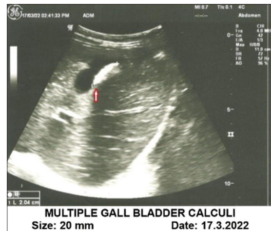
Figure 1: Ultrasonography findings before treatment

Little is known about the epidemiology of cholelithiasis in children. Cholelithiasis and choledocholithiasis were considered to be uncommon in infants and children but have been increasingly diagnosed in recent years due to the widespread use of ultrasonography. Small stones can