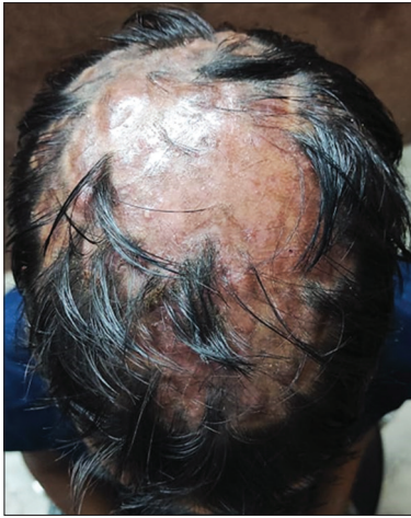
Figure 4: Follow-up (5 th April 2021)