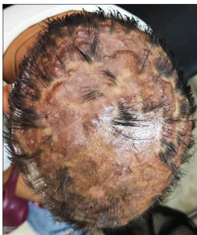
Figure 2: Before treatment (2 nd March 2021)