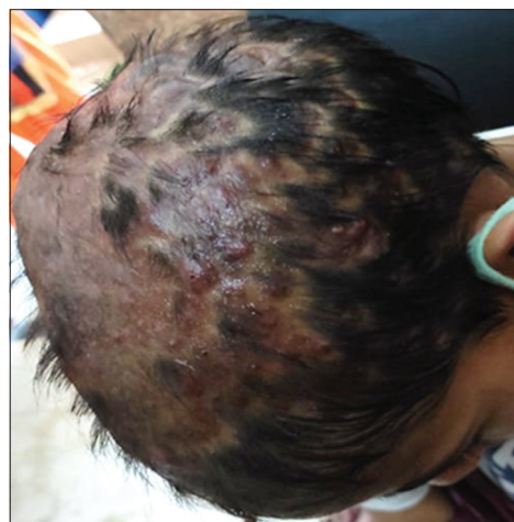
Figure 3: Before treatment (2 nd March 2021) (side view)