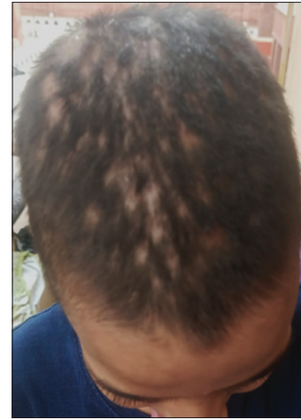
Figure 7: Follow-up (11 th August 2021)