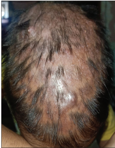
Figure 5: Follow-up (8 th May 2021)