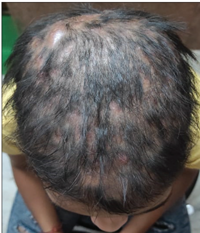
Figure 6: Follow-up (10 th July 2021)

As per aphorism no. 190, in Organon of medicine , sixth edition, 'all true medical treatment of a disease on the external parts of the body that has occurred from little or no injury from without must, therefore, be directed against the whole, must