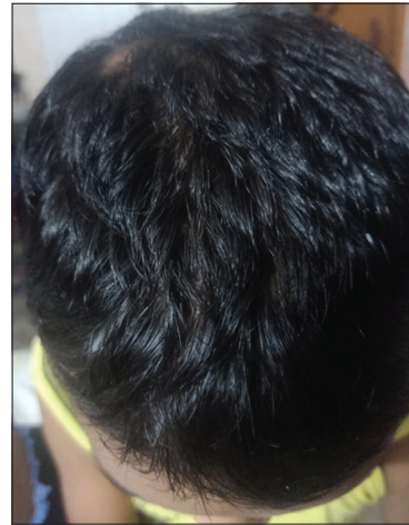
Figure 8: Follow-up (14 th September 2021)