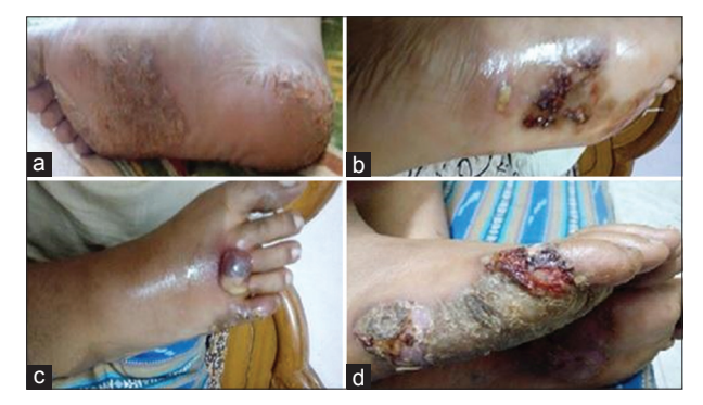
Figure 2: (a-d) Plantar lesions before the treatment

a journey and walking on bare feet, which acted as an exciting cause to trigger the acute exacerbation of the lesions. At that time, based on the acute totality, Merc sol was again repeated with relief of lesions. At this point, the case was reassessed and Pulsatilla still seemed to be indicated based on the available totality. Considering the lack of improvement even