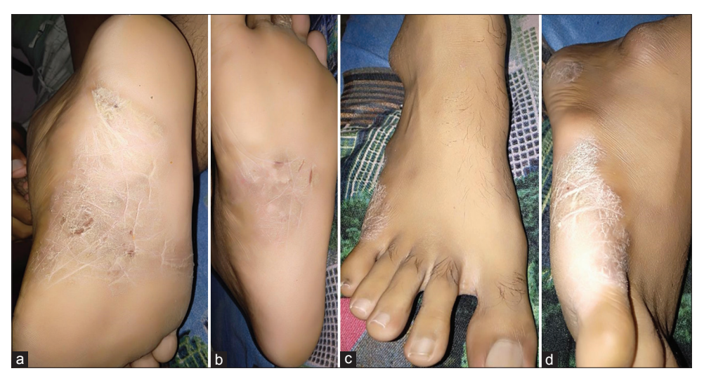
Figure 3: (a-d) Plantar lesions after the treatment

condition of the patient. The frequency of acute exacerbations of the foot lesions gradually decreased. Improvement in the local lesions is evident from the substantial reduction in the PASI score from the baseline value of 26.8-1.6 by the end of the follow-up. As per the modified Naranjo Criteria, there was an improvement in the primary symptom (+2); within a plausible timeframe after the intake of medicine (+1); with an improvement in other symptoms (+1) and overall well-being (+1); with no other alternative causes that could have caused the improvement (+1). Further, there was an objective improvement in the skin lesions after the remedy, evidenced by photographs and PASI score (+2). The remedy, on repetition of dose, has resulted in a similar clinical improvement (+1). Thus, in this case, the total score of 9 establishes a definite causal attribution of homoeopathic treatment with the outcome.