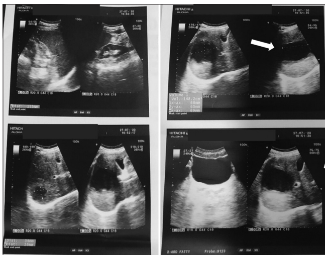
Figure 3: Ultrasonography - whole abdomen (27 June, 2020) showed mild hepatomegaly with a hypo-echoic lesion. Spleen enlarged to a span of 14.8 cm