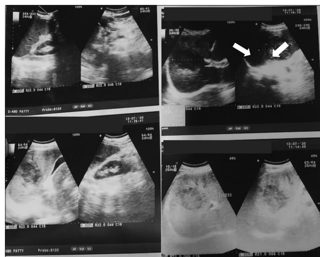
Figure 1: Ultrasonography- whole abdomen (13 June, 2020) showing a hypo-echoic lesion in the right lobe of liver