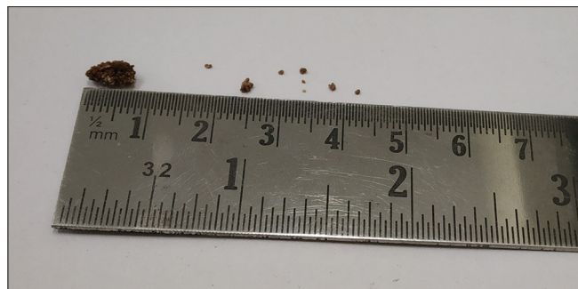
Figure 3: Expelled calculi

In this case, the total score of outcome as per Modified Naranjo Criteria score after treatment was 8, which is close to the