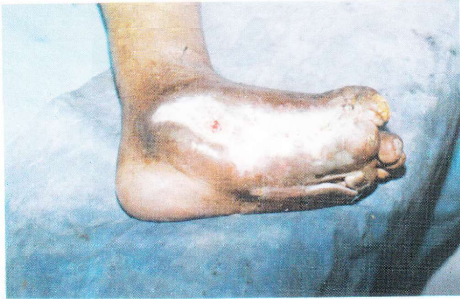
Fig. 3. A view of the Ulcer during treatment