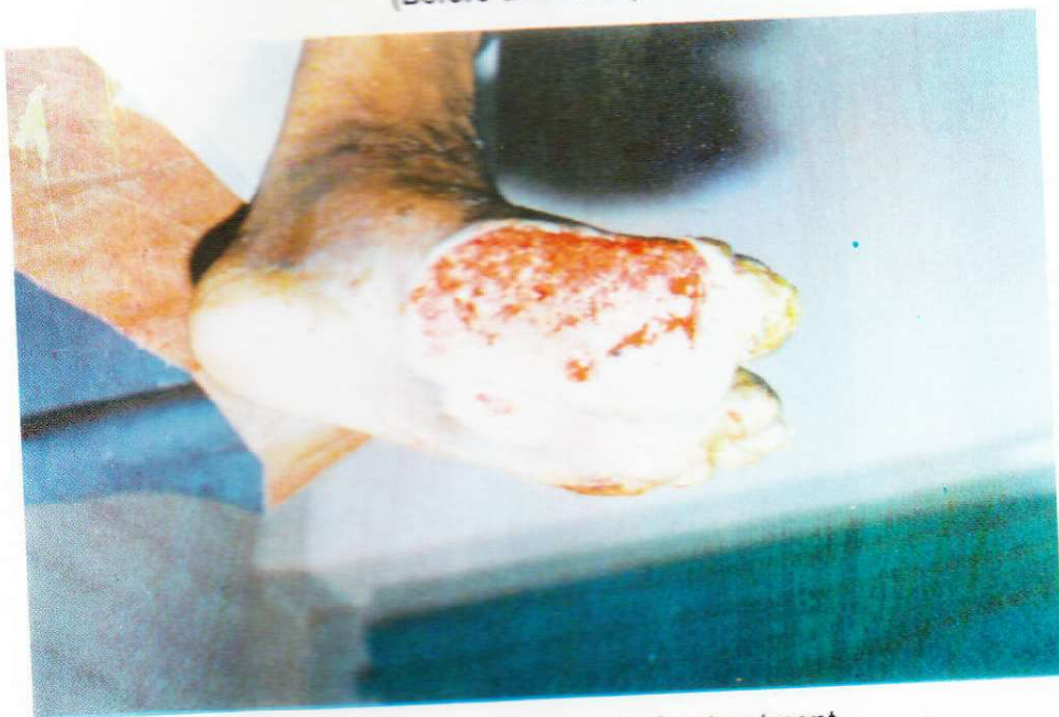
Fig. 2. A view of the Ulcer during treatment