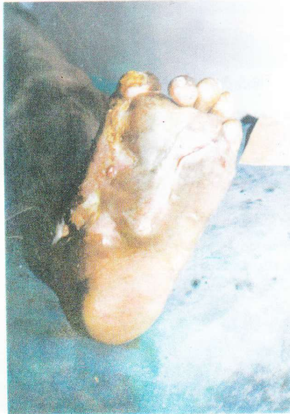
Fig. 4. A view of the Ulcer after two months of treatment