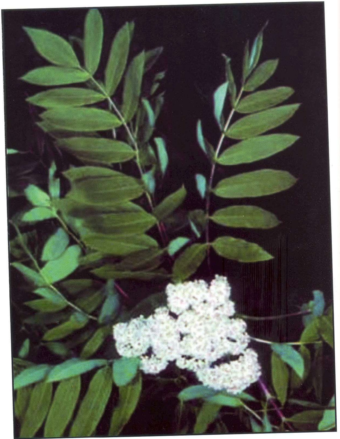
Pyrus americana - flowers