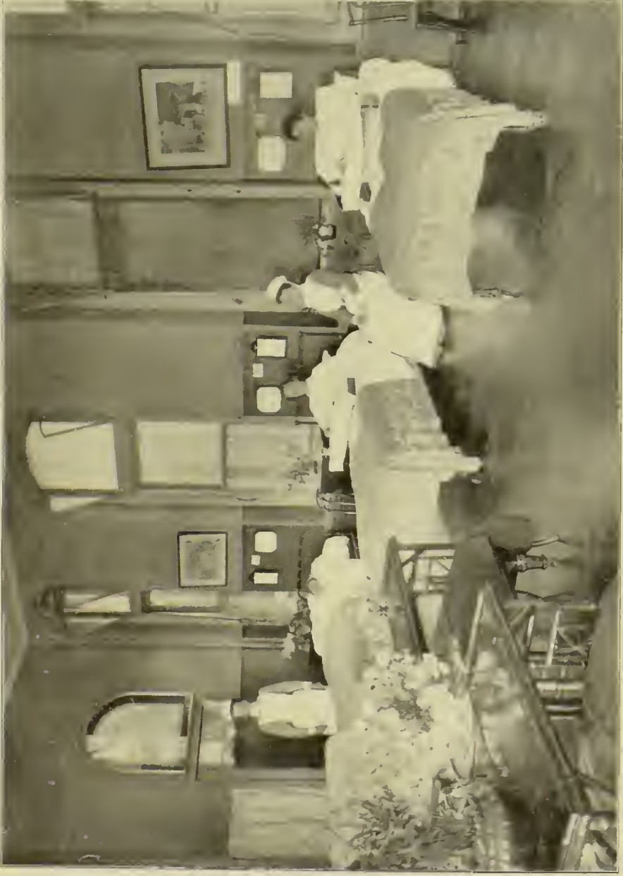
LONDON HOMŒOPATHIC HOSPITAL. A Medical Ward.