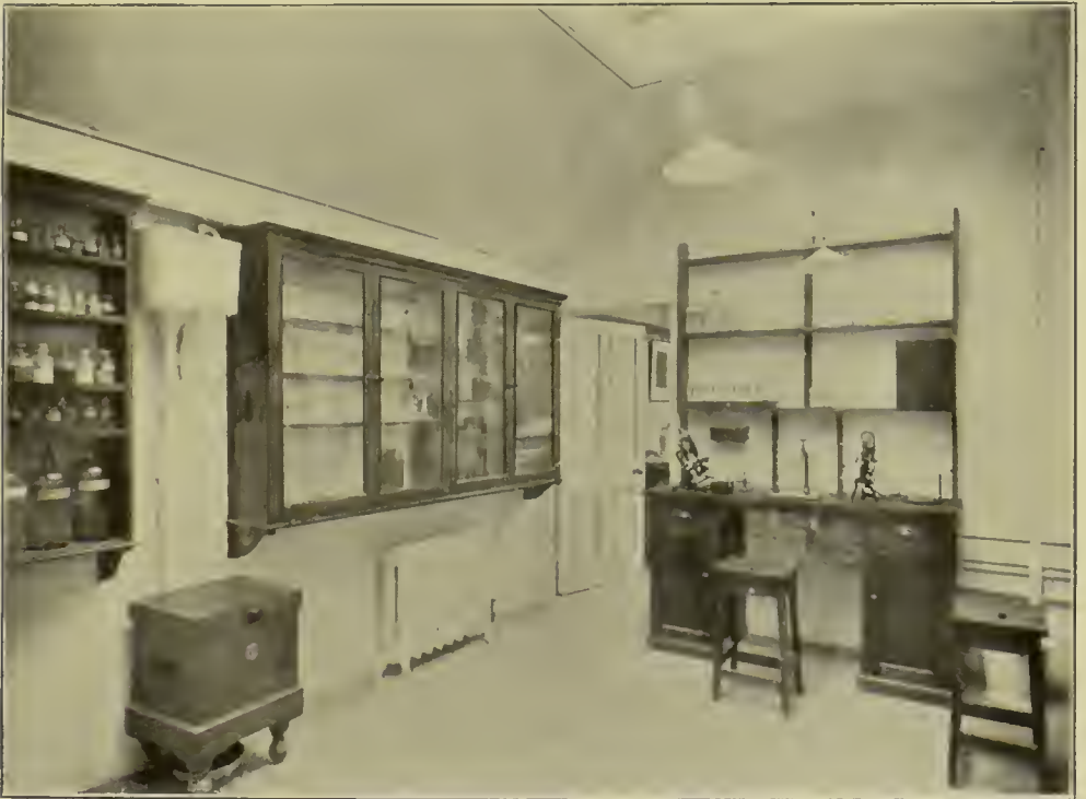
LONDON HOMŒOPATHIC HOSPITAL. Two views of the Pathological Laboratory.