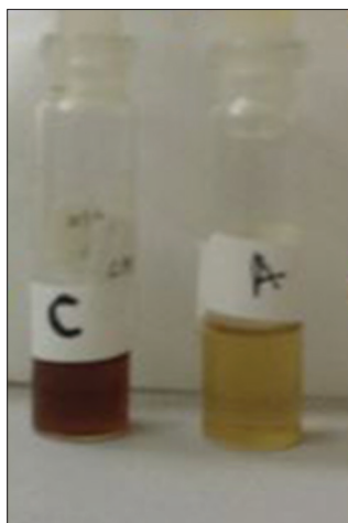
Figure 2: Authentic in-house (A) and commercial (C) mother tincture

we could infer that the commercial differs substantially from the authentic sample [Figure 2]. However, the origin of this disparity could not be ascertained without further study.