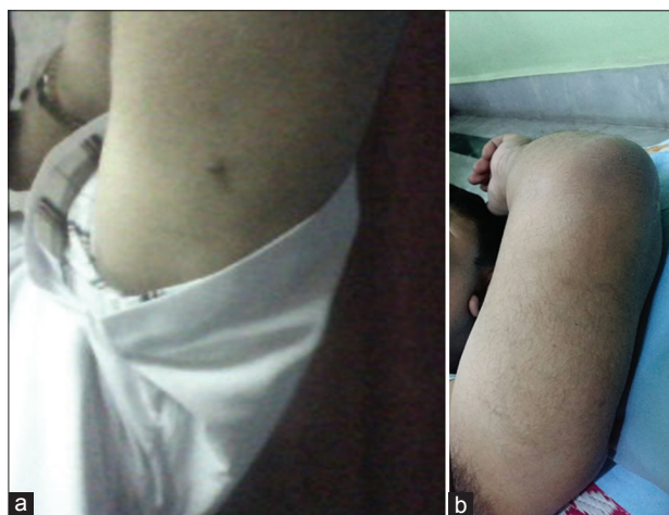
Figure 1: (a) Case-1, before treatment, (b) Case-1, after treatment

On repertorial analysis “ Thuja ,” “ Lyco ,” and “ Verat alb. ” scored highest marks (9) covering most of the rubrics (5 out of 9). According to miasmatic consideration, sycotic miasm was prominent and