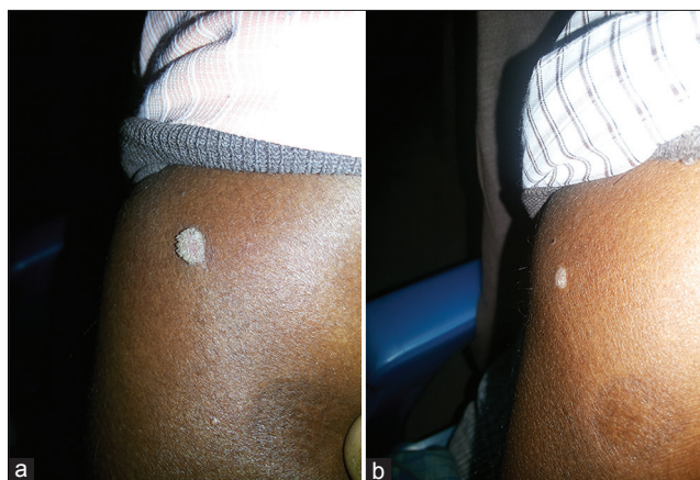
Figure 4: Case-4, before treatment, (b) Case-4, after treatment

On repertorial analysis, both “ Thuja ” and “ Nitric Acid ” have scored highest marks (14) covering most of the rubrics (7 out of 12). In this case, symptom showed that the patient had hydrogenoid constitution and strong prominence of sycotic miasm. Therefore, Thuja was most suitable remedy for this case [Table 4].