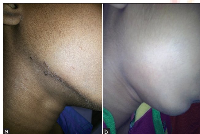
Figure 5: Case-5, before treatment, (b) Case-5, after treatment

On repertorial analysis, “ Causticum ” has scored highest marks (10) covering most of the rubrics (4 out of 5). The mental general, physical general and particular general symptomatologies were well covered by this remedy. Hence, the most appropriate remedy for this case was “ Causticum ” [Table 5].