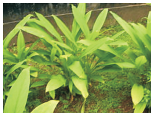
Curcuma longa Plant

Curcuma longa is a small perennial plant distributed in South Asia and is cultivated extensively throughout warmer parts of the world, including India. 2 It has many rhizomes on its root system which are the source of its culinary spice known as Turmeric and its medicinal extract called Curcumin. 1