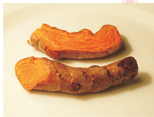
Rhizome of Curcuma longa

The common names of Curcuma longa are- Bengali- Haldi, Halud; English- Indian saffron, Turmeric; Gujarati- Halada, Haldar; Hindi- Halda; Haldi, Hardee; Kashmiri- Lidar; Malayalam- Mannal, Manjal; Marathi- Halad, Halede; Punjabi- Haldi, Halja, Haldar; Sanskrit- Aneshta, Bahula; Tamil- Manjal, Mancal. 2,3