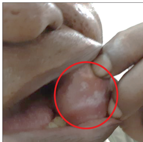
Figure 1: Oral leucoplakia-before treatment (27 October 2018)

Following complete case taking in accordance with homoeopathic principles, the following characteristic