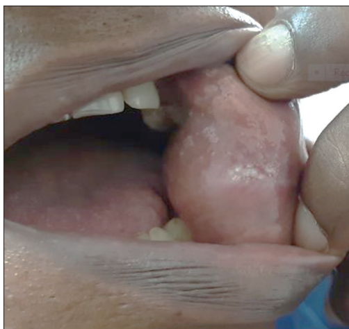
Figure 3: Oral leucoplakia-during treatment (20 April 2019)