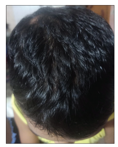
Figure 8: Follow-up (14th September 2021)

effect the annihilation and cure of the general malady by means of internal remedies, if it is wished that the treatment should be judicious, sure, efficacious and radical'. [22] In this case, Pulsatilla nigricans was found to be the most indicated remedy homoeopathically which was prescribed in increasing potencies from 200 to 1M, as per the response from the patient, over 6 months, based on homoeopathic principles as shown in Table 1.