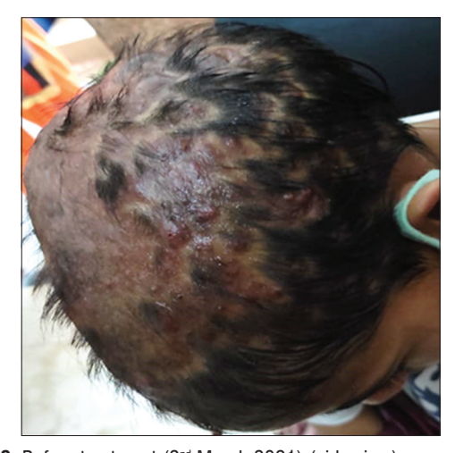
Figure 3: Before treatment (2<sup>nd</sup> March 2021) (side view)

This is a case of tinea capitis in a female child effectively treated with individualised homoeopathic medicine Pulsatilla nigricans . The case was diagnosed as that of tinea capitis based on the history of complaints and clinical examination. The treatment with the modern system of medicine (antifungal treatments, anti-inflammatory agents such as systemic steroids, antifungal shampoos and topical applications) is not only costly but also has potential side effects such as headache, gastrointestinal distress, taste disturbances, cutaneous eruptions and liver enzyme abnormalities.<sup>[24,25]</sup> The same has been described by Dr. Samuel Hahnemann in Organon of Medicine (aphorism 203), as 'this pernicious external mode of treatment,