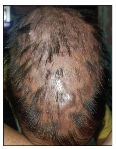
Figure 5: Follow-up (8th May 2021)