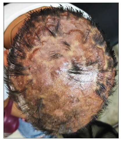
Figure 2: Before treatment (2nd March 2021)