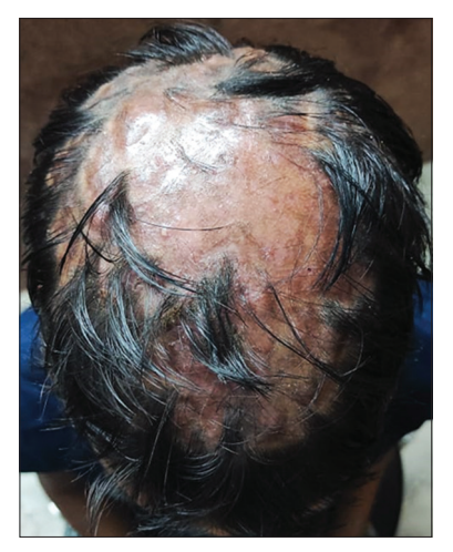
Figure 4: Follow-up (5th April 2021)