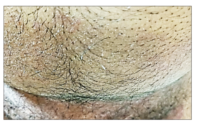
Figure 2: Lesions as on 12 January 2022: Lower abdomen

The previous studies also show the significant role of individualised homoeopathic medicines in dermatophyte infections. However, the homoeopathic literature has little evidence of treatment of fungal infection which is also mentioned in the case report by Gautam and Goel. [18] Interestingly, two cases of tinea faciei treated with homoeopathic medicines have been reported, out of which one case was treated with Natrum muriaticum 30C and potency was increased as per need. [10] Further, a few traceable reported literature for tinea cruris were found. Another case of tinea cruris successfully treated with Sulphur highlighted the