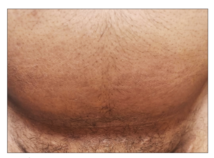
Figure 8: Lesions as on 8 June 2022 Lower Abdomen