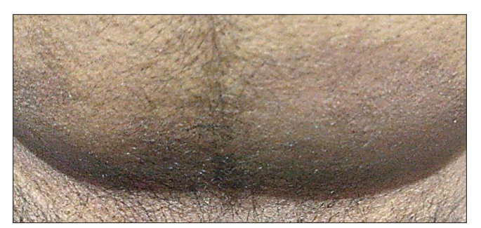
Figure 4: Lesions as on 23 March 2022: Lower abdomen