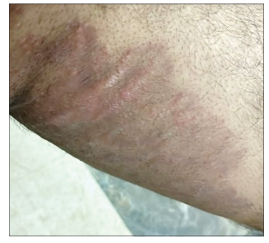
Figure 3: Lesions as on 12 January 2022: Inner thigh (Left)

importance of miasms for effective prescription.<sup>[19]</sup> The above literature suggests that homoeopathic medicines are useful for