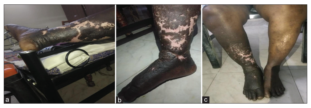
Figure 4: (a-c) After treatment, complete closure of the ulcer and significant reduction in oedema as on 25 April 2021