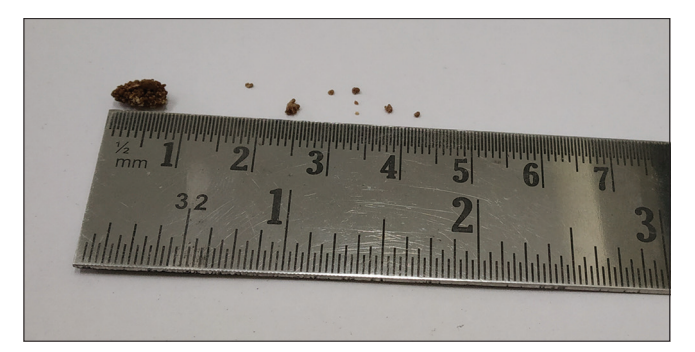
Figure 3: Expelled calculi

The patient was already a diagnosed case of hyperuricaemia, and serum uric acid was tested again to know about the present status. His investigations revealed following significant findings: