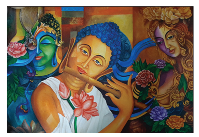
Figure 3: Patient's art: A Picture depicting Lord Krishna and Lord Buddha

wife having extramarital relations as mentioned earlier), delusion of grandiosity (he believed that he was a form of God), and delusion intuition. He did not have any perceptual disturbances. His attention and concentration were poor, but was well oriented with time and place. He had good memory, poor abstract thinking and impaired test and social judgement. His insight was absent.