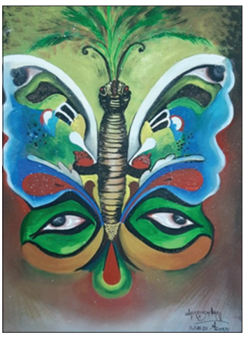
Figure 4: Patient's art: A Picture depicting Kathakali and Butterfly