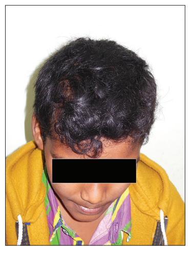
Figure 3a: After treatment