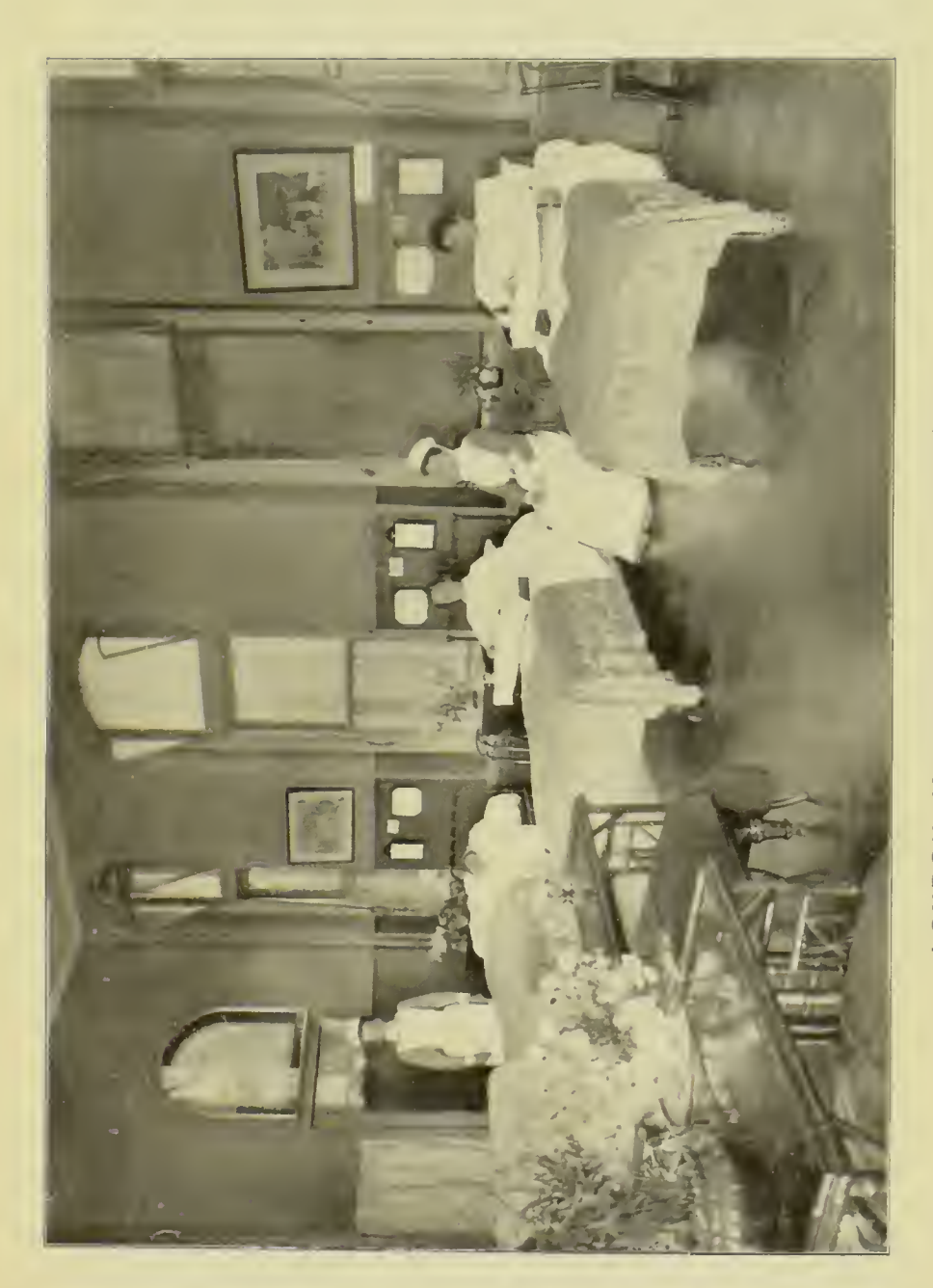
LONDON HOMŒOPATHIC HOSPITAL. A Medical Ward.