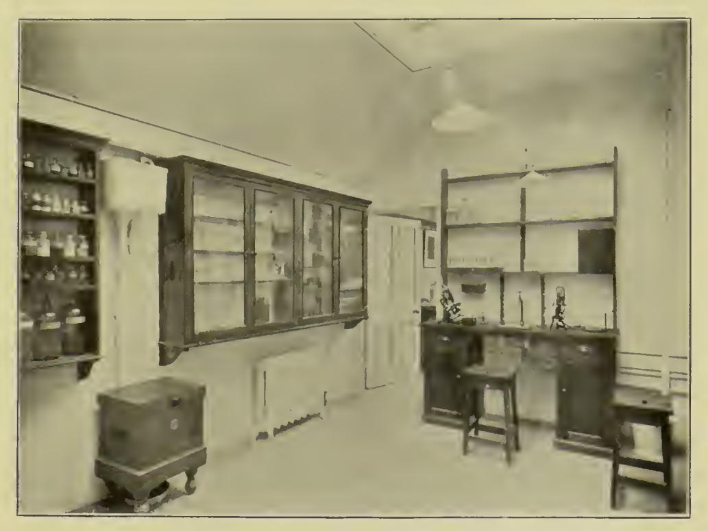
LONDON HOMŒOPATHIC HOSPITAL. Two views of the Pathological Laboratory.