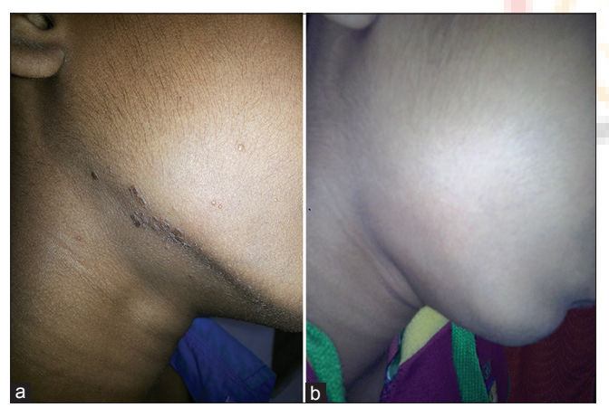
Figure 5: Case-5, before treatment, (b) Case-5, after treatment

On repertorial analysis, " Causticum " has scored highest marks (10) covering most of the rubrics (4 out of 5). The mental general, physical general and particular general symptomatologies were well covered by this remedy. Hence, the most appropriate remedy for this case was " Causticum " [Table 5].