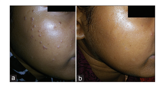
Figure 3: (a) Case-3, before treatment, (b) Case-3, after treatment

3rd visit on September 07, 2014: Rest of warts were completely subsided, patient was prescribed Placebo [Figure 3b].