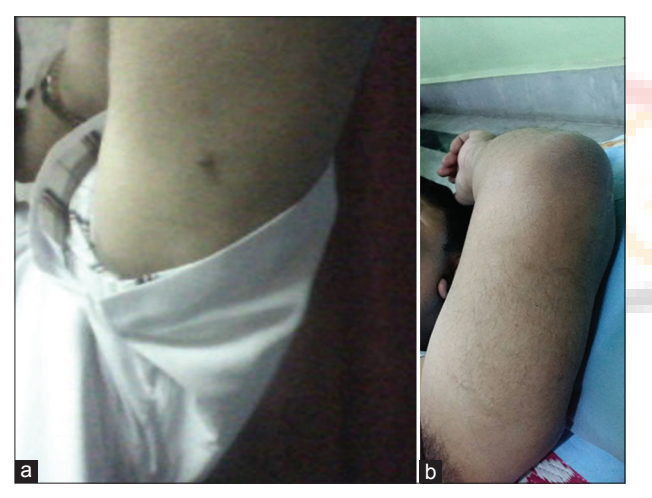
Figure 1: (a) Case-1, before treatment, (b) Case-1, after treatment

On repertorial analysis " Thuja ," " Lyco ," and " Verat alb ." scored highest marks (9) covering most of the rubrics (5 out of 9). According to miasmatic consideration, sycotic miasm was prominent and