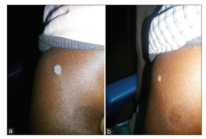
Figure 4: Case-4, before treatment, (b) Case-4, after treatment

On repertorial analysis, both " Thuja " and " Nitric Acid " have scored highest marks (14) covering most of the rubrics (7 out of 12). In this case, symptom showed that the patient had hydrogenoid constitution and strong prominence of sycotic miasm. Therefore, Thuja was most suitable remedy for this case [Table 4].